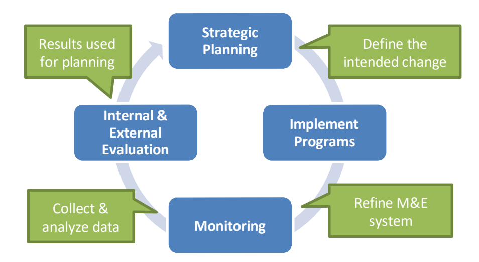
Cycle of planning, implementation, M&E, learning and improving is a continuous process

GoodWeave's M&E system makes up an important part of a larger continuous process of organizational planning, program implementation, and learning. Departmental heads and staff use the findings from the monitoring data for assessing progress, planning and refining program activities. The results of the M&E program are circulated, discussed in Executive Leadership Team meetings, used as inputs for organization-wide strategic planning, and key findings and recommendations are reported to the GoodWeave International Board of Directors. Based on the outcomes of these activities, all components of the M&E system undergo a process of continuous refinement, at least annually.